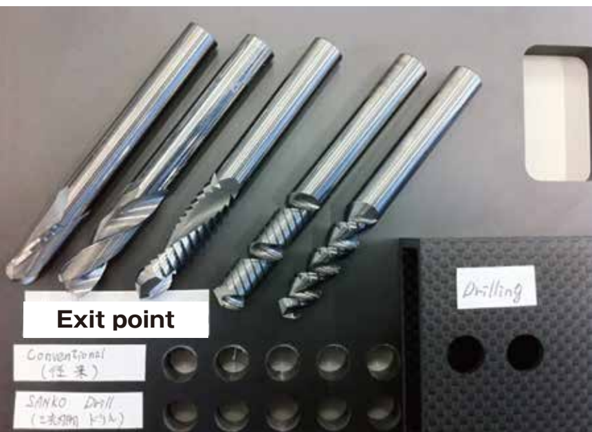
Drilling test (Outlet side of the CFRP-UD)