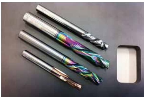
Compression router (for CFRP)