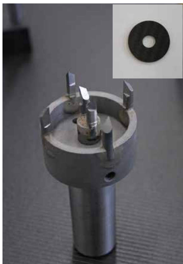
Hole cutter (for CFRP)