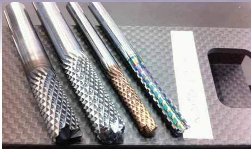
Fiber router (for CFRP)