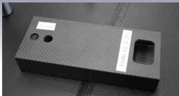
Cutting test (CFRP)